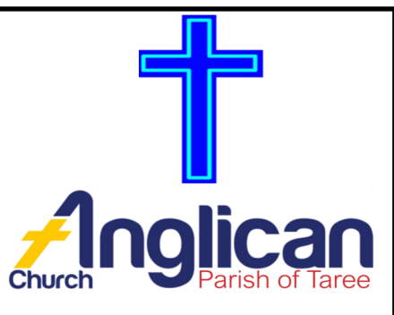
St Johns 294 Victoria Street Taree