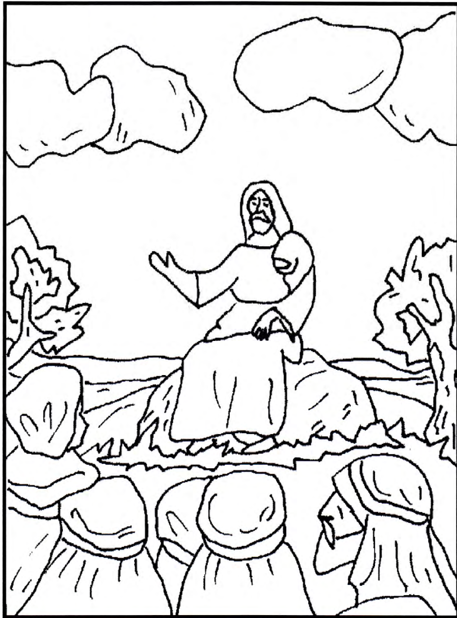
The Sermon on the Plain Luke 6:17-26