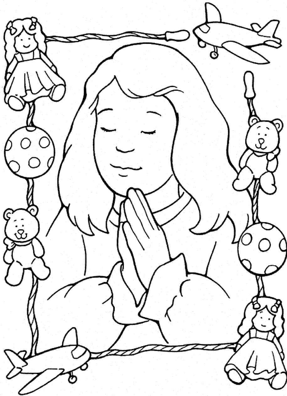
Keep on praying and never give up. Luke 18:1-8