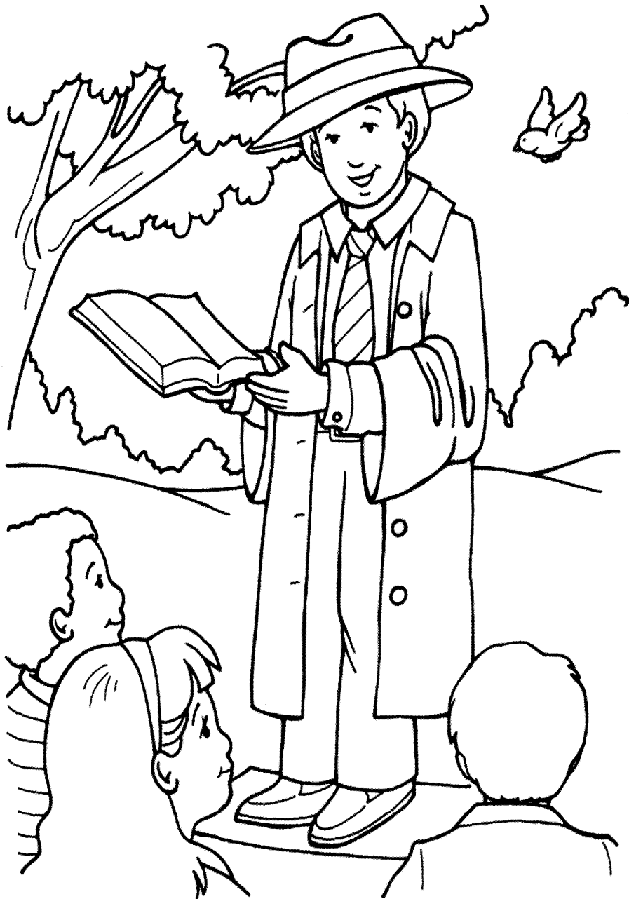
Christ gave me the work of preaching the Good News.