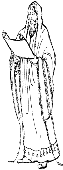
A teacher of the Law