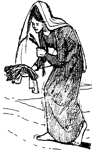
A poor widow

Jesus compared the teacher of the Law with a poor widow. Put (T) teacher and (W) widow against the things Jesus pointed out.